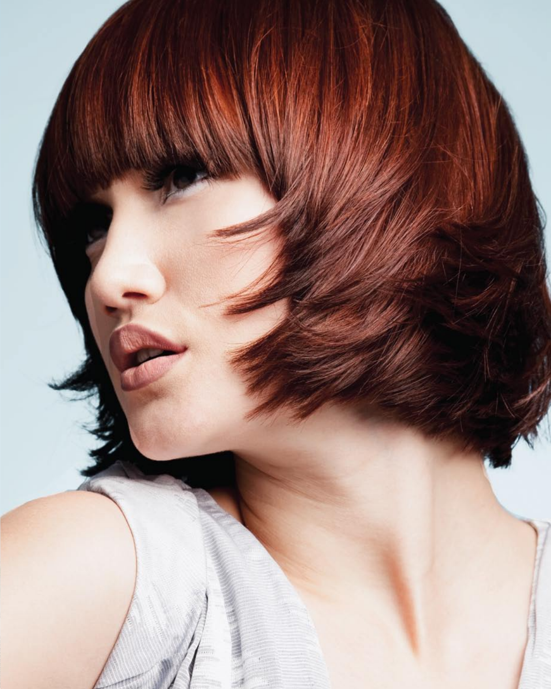
HAIR Beverly C for Beverly C - PHOTO Desmond Murray - MAKE UP Lauren Mathis - STYLING Bernard Connolly - PRODUCTS Goldwell